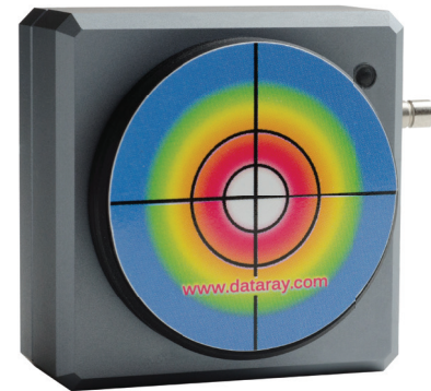
WinCamD-LCM 1.8 x 1.8 x 0.8 in 46 x 46 x 20 mm

The WinCamD-LCM is paired with DataRay's full-featured software which has no license fees, unlimited installations, and free software updates. It is ideal for applications including: CW and pulsed laser profiling; field servicing of laser systems; optical assembly; instrument alignment; beam wander and logging; R&D; OEM integration; quality control; and M^2 measurement with available M2DU systems.