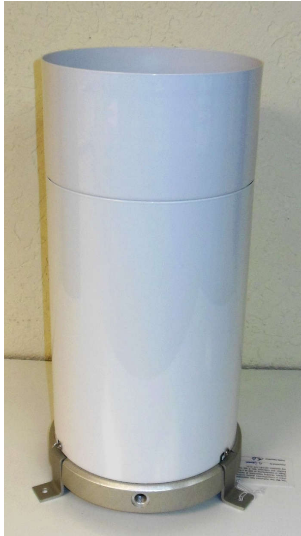
Figure 1-1 370D

The Model 370D and 372D Tipping Bucket Rain Gauges are virtually the same. The primary difference between them is that the 370D can have multiple calibration rates whereas the 372D is calibrated specifically for 0.5 mm of rainfall per tip. For simplicity, the rest of this manual will only reference model number 370D, except where notable differences occur.