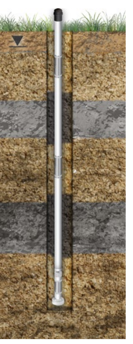
Typical 3 or 7-Channel CMT Installation using Layers of Bentonite and Sand Backfilled from Surface