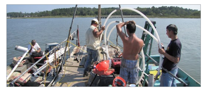
CMT Systems were installed at the bottom of a bay to measure submarine groundwater discharge. Eight 7-Channel CMT Systems were installed, with custom modifications to suit the open water application. Watertight wellheads had to be custom built to allow for sampling from the surface of the bay using a peristaltic pump.