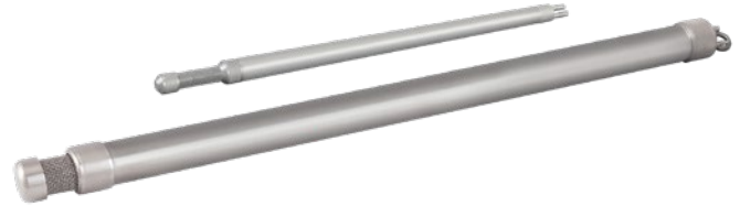
1.66" (42 mm) and 5/8" (16 mm) Diameter Stainless Steel Double Valve Pumps