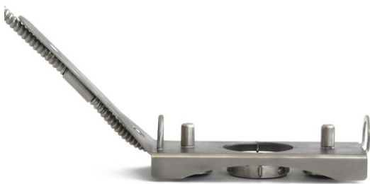
Figure 3 HF01 heat flux and surface temperature sensor with frame with magnets

HF01 heat flux sensor calibration is traceable to SI units. The factory calibration method follows the recommended practice of ASTM C1130. The recommended calibration interval of heat flux sensors is 2 years.