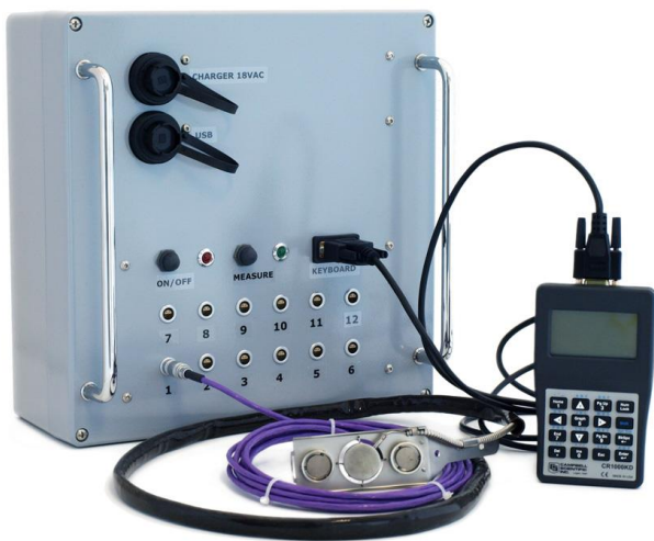
Figure 1 the ALUSYS measuring system, for trend - monitoring and comparative surveys of heat flux and surface temperature in industrial environments. Connected to the MCU: one HF01 sensor, as well as the Keyboard Display.

ALUSYS is a measuring system for trend-monitoring and mobile survey of heat flux and surface temperature in industrial environments. Sensors and electronics have the robustness necessary for this application. Powered from a low-voltage rechargeable battery, it is easy and safe to use. In its standard configuration the system consists of an MCU Measurement Control Unit in a metal housing and 12 x heat flux and surface temperature sensors of model HF01. Measured data are stored for later analysis.