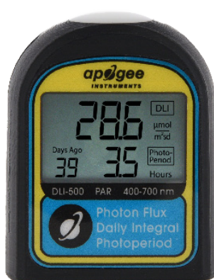
DLI-500: Full-Spectrum PAR 400-700 nm