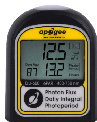
DLI-600: ePAR ePAR 400-750 nm