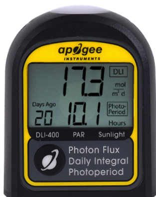
DLI-400: Sunlight Only PAR 400-700 nm

New for 2022, Apogee DLI meters are a rugged, simple-to-use device for spot checking PAR or ePAR levels while automatically recording the daily light integral and hours of light (photoperiod) for up to 99 days.