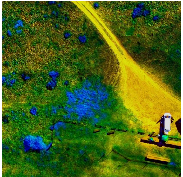
Hyperspectral Mapping with the FirefLEYE 185