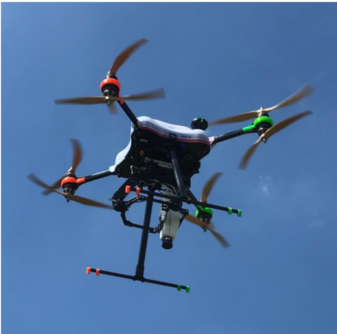
FirefLEYE 185 mounted on a UAS