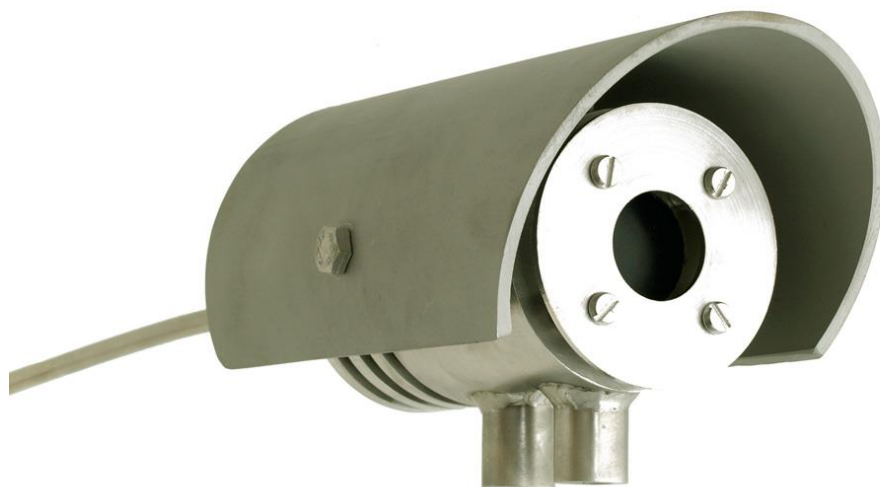
Figure 0.1 HF02. Standard cable length is 3 m high temperature metal sheathed cable plus 3 m low temperature extension cable.

HF02 should be regularly inspected. The sensor performance can be verified by comparison to a portable heat flux sensor such as model HF03.