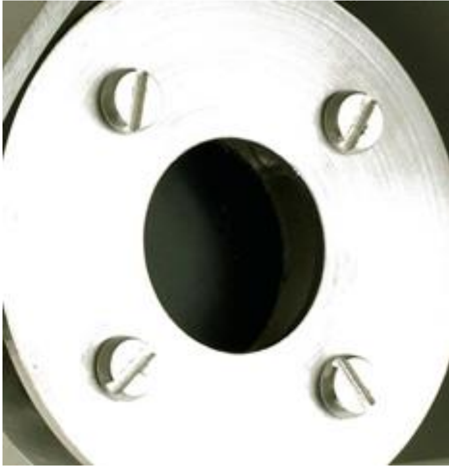
Figure 6.1.1 Picture of HF02's sensor surface. The sensor surface should be inspected on a weekly basis. The picture shows that the sensor field of view is unobstructed, and that the sensor surface is not scratched and that it is clean.