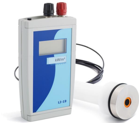
Figure 1 HF03-LI19 portable heat flux sensor with read-out unit / datalogger

HF03 is a heat flux sensor that is applied in mobile measurements. It is combined with LI19, a high accuracy handheld read-out unit / datalogger. The combination HF03- LI19 is typically used to study heat flux levels of flares and fires, and to verify the performance of permanently installed flare radiation monitors and flare heat flux sensors.