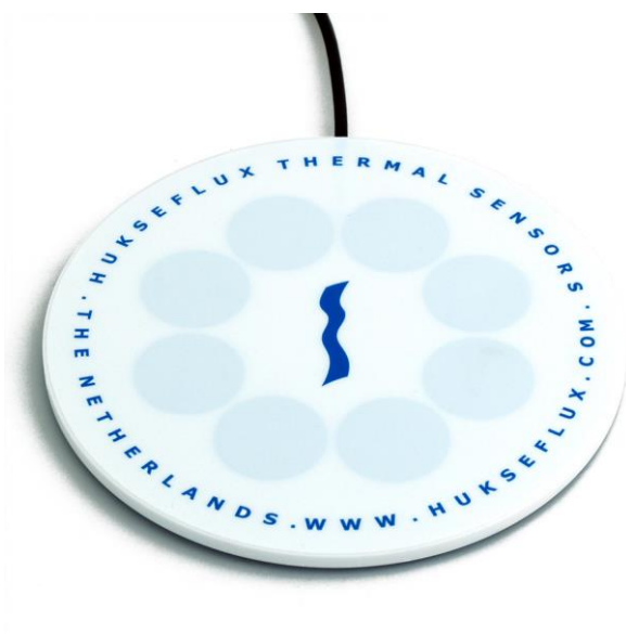
Figure 1 HFP03 ultra sensitive heat flux plate

HFP03 is an ultra sensitive sensor for measurement of small heat fluxes in the soil as well as through walls and building envelopes. The total thermal resistance is kept small by using a ceramics-plastic composite body. See also model HFP01 : putting several HFP01 sensors electrically in series is an alternative for using HFP03.