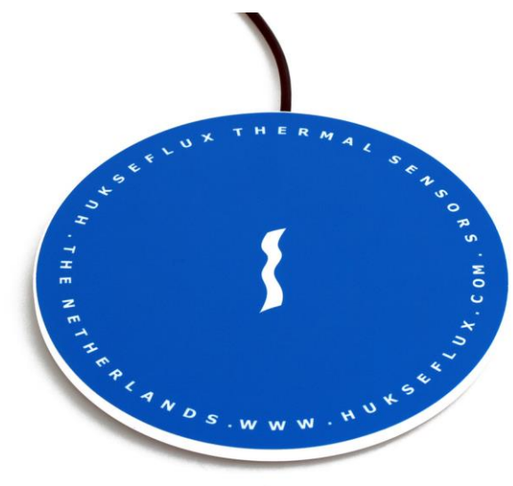
Figure 2 opposite side of HFP03, which has a blue coloured cover