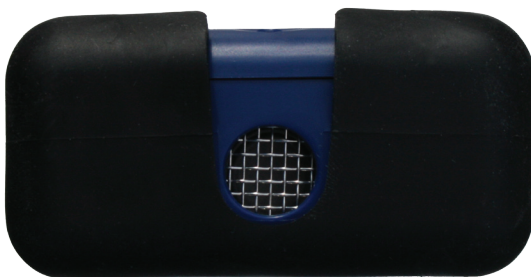
Ruggedized boot and Stand Included