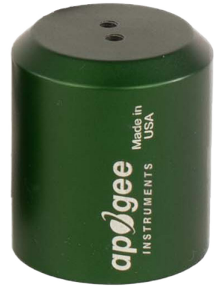
S2-112-SS & S2-412-SS