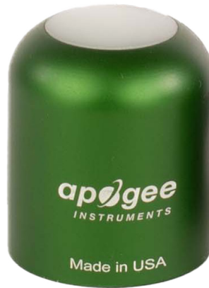
S2-111-SS & S2-411-SS