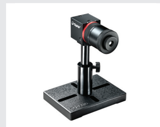
SP920s-1550 camera equipped with X4 Beam Expander to provide ISO beam profiling and good resolution for narrow and focused laser beams.

accuracy compared to Ophir InGaAs sensor cameras or Ophir NanoScan (scanning slit) beam analyzers. However, in case of smaller or focused beams, the SP920s-1550 can be used in combination with the X4 Beam Expander, thus reducing minimal size of analyzed beam to just 150µm.