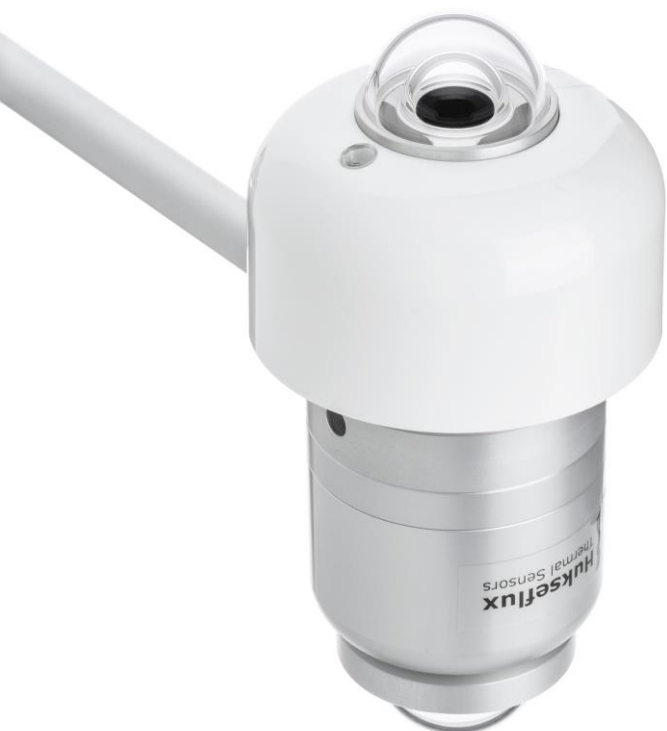
Figure 1 SRA30-M2-D1 albedometer

SRA30-D1 digital spectrally flat Class A albedometer is an instrument that measures global and reflected solar radiation and the solar albedo, or solar reflectance. SRA30-M2-D1 is the most accurate albedometer available, and heated for the best data availability. It is composed of one AMF03 albedometer mounting kit and two SR30-M2-D1 spectrally flat Class A (previously "secondary standard") pyranometers. This pyranometer is compliant in its standard configuration with the requirements for Class A PV monitoring systems of the IEC 61724-1:2017 standard. Each pyranometer has a thermopile sensor, the upfacing one measuring global solar radiation, the downfacing one measuring reflected solar radiation. AMF03 includes one glare screen, one mounting fixture with rod, mounting hardware and tools. SRA30 complies with the latest ISO and WMO standards. The modular design facilitates maintenance and calibration.