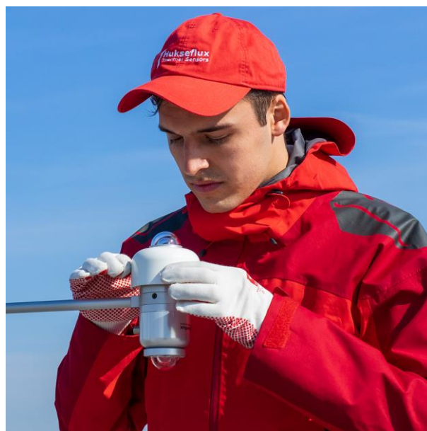
Figure 5 using SRA30 albedometer is easy; the instrument is composed of AMF03 and two SR30-M2-D1 pyranometers