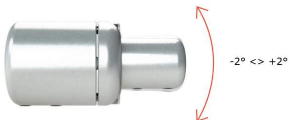
Figure 3 ALF01 albedometer levelling tool

ALF01 is a levelling tool that can be used with AMF03 to easily level the instrument. The ALF01 is mounted on a 1 inch outer diameter crossarm, and can be rotated around the tube axis for 360 ° as well as tilted over \pm 2^\circ .