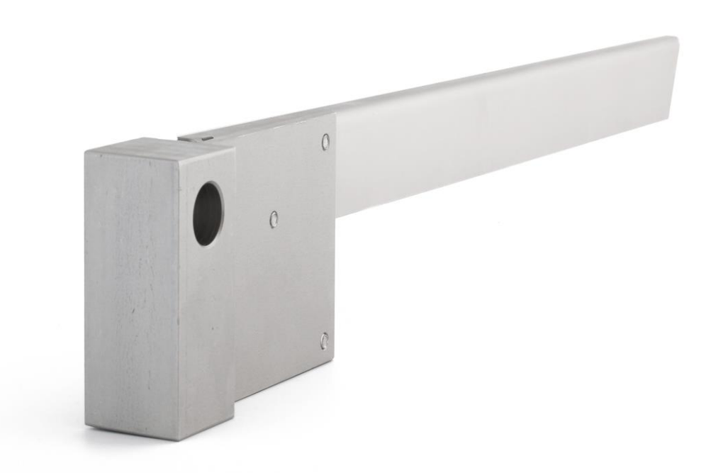
Figure 0.3 IT01 insertion tool is hammered down into the soil. After retracting it leaves a slit in which STP01 may be inserted.