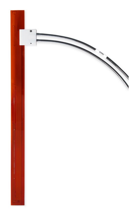
Figure 0.1 STP01. Standard cable length is 5 m.

Equipped with heavy duty cabling, and potted so that moisture does not penetrate the sensor, STP01 has proven to be very robust and stable. It survives long-term installation in soils. For ease of installation with a minimum of disturbance of the local soil, Hukseflux offers IT01 insertion tool.