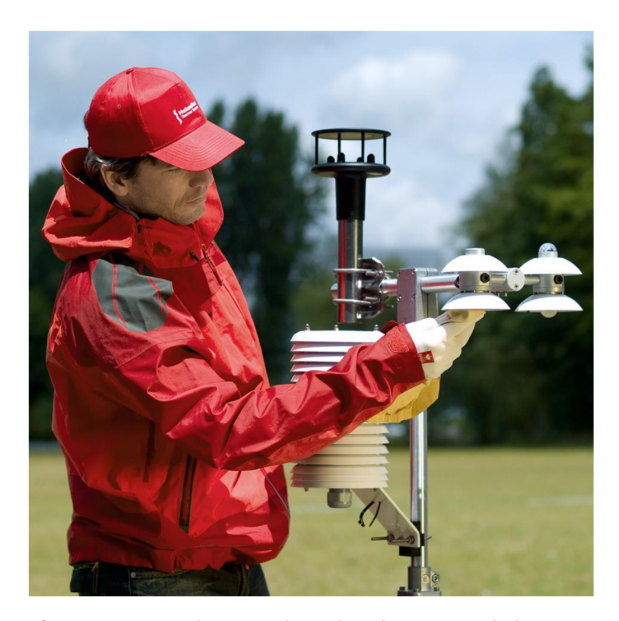
Figure 4.1 typical meteorological surface energy balance measurement system with STP01 installed in the soil

Usually this measurement is combined with measurements of the soil heat flux, soil thermal conductivity and soil heat capacity to estimate the heat flux at the soil surface. Knowing the heat flux at the soil surface, it is possible to "close the balance" and estimate the uncertainty of the measurement of the other (convective and evaporative) fluxes.