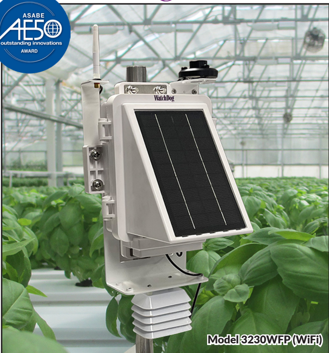
Model 3230WFP (WiFi)