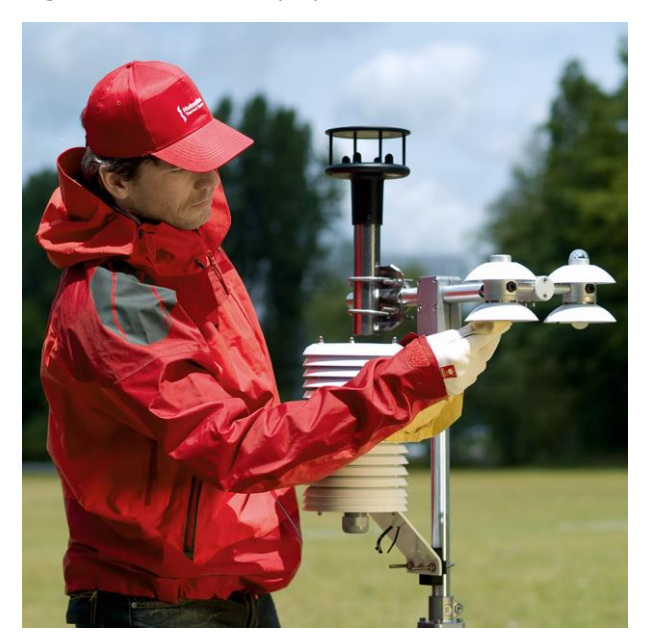
Figure 2 TP01 is typically used in high-accuracy surface flux measurement stations