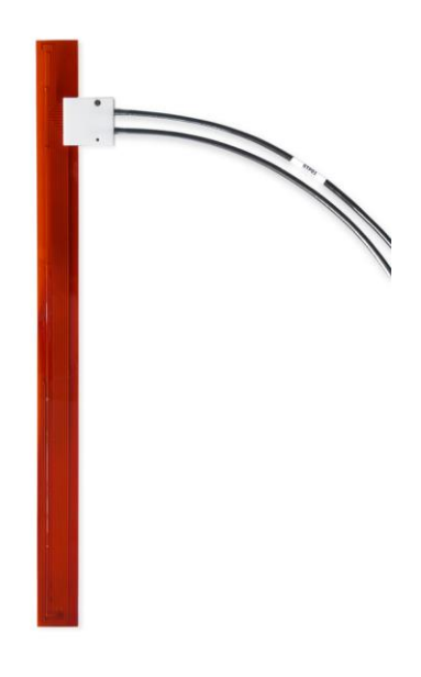
Figure 5 STP01 soil temperature profile sensor which is often combined with TP01 for soil energy budget calculation.

Hukseflux has equipped several testbeds in the electrical power industry, to monitor dryout, thermal runaway and thermal stability around mockup high-voltage power lines. Here the capability to perform a crude measurement of thermal diffusivity is an important feature, for modelling behavior under dynamic loads.