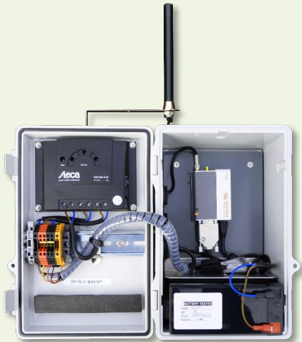
3G-DLC-BX1/SP and 3G-BX1/SP Modem Box

Please note that the logger (ordered separately) has to be mounted outside the modem box. A Data Package is also required to complete the system. To ensure the system meets your needs, please request a quotation before ordering.