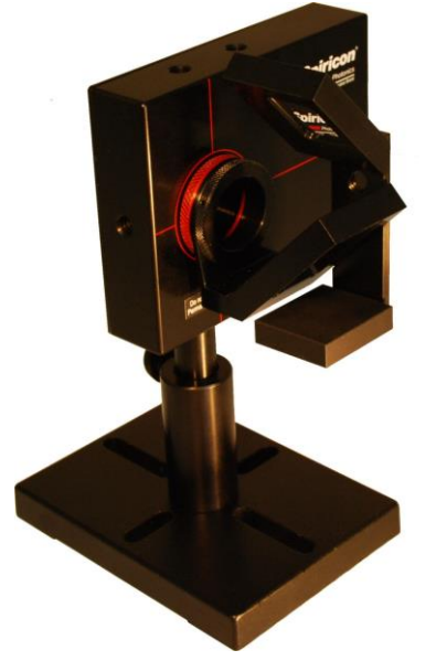
45 deg beam splitter P/N SPZ17015 as provided to give 20X attenuation.

With additional 45 deg beam splitter (P/N SPZ17026 mounted to give 20x20=400 X attenuation