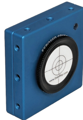
BladeCam2 1.8 x 1.8 x 0.5 in 46.0 x 46.0 x 12.8 mm

The BladeCam2™ is paired with DataRay's full featured, highly customizable, user-centric software which has no license fees, unlimited installations, and free software updates. It is perfect for applications including: CW laser profiling; field servicing of laser systems; optical assembly; instrument alignment; beam wander and logging; R&D; OEM integration; quality control; and M 2 measurement with available M2DU stage.