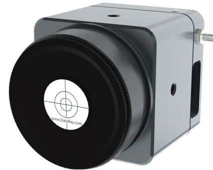
TaperCamD-LCM 2.25 x 2.25 x 2.13 in 57 x 57 x 54 mm

The TaperCamD-LCM is paired with DataRay's full-featured, highly customizable, user-centric software (which has no license fees, unlimited installations, and free software updates). It is perfect for applications including: CW and pulsed laser profiling; field servicing of laser systems; optical assembly; instrument alignment; beam wander and logging; R&D; OEM integration; and quality control.