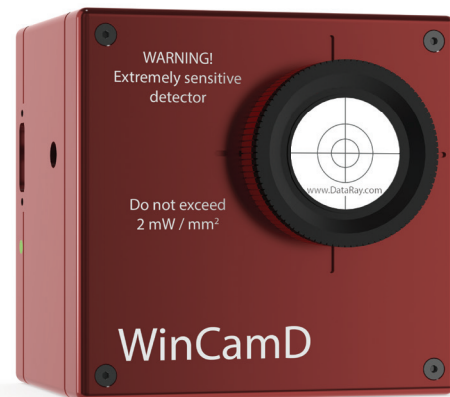
WinCamD-IR-BB 2.8 x 2.8 x 2.0 in 73 x 73 x 52 mm