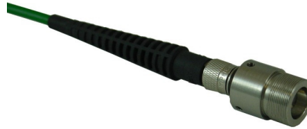
Fiber patch cord not included

The full field of view (FOV) or full divergence angle can be calculated as FOV = 2\text{atan}(D/2f) where D is the fiber core diameter and f is the focal length of the lens. Alternatively, the linear field of view on an object placed a distance L away from the collimator is D(L/f) .