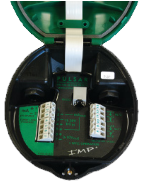
Inside the lid of an IMP Lite