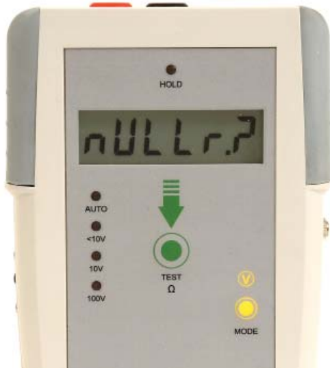
Figure 17: Press MODE to select NULL process