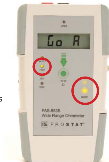
Figure 4: Press MODE to manually Change Test Voltage