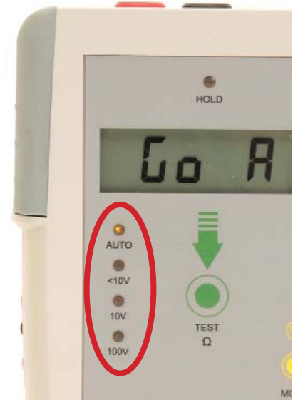
Figure 12: Manual Mode