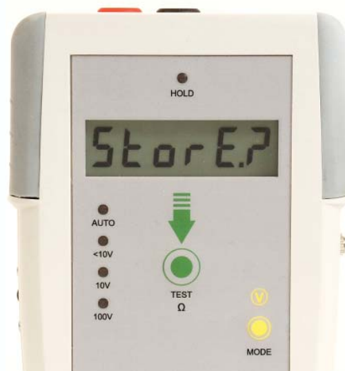
Figure 19: E12 C? and StorE? will display