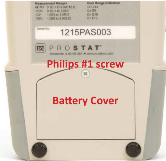
Figure 6: PAS-853B Battery Compartment on bottom of Instrument