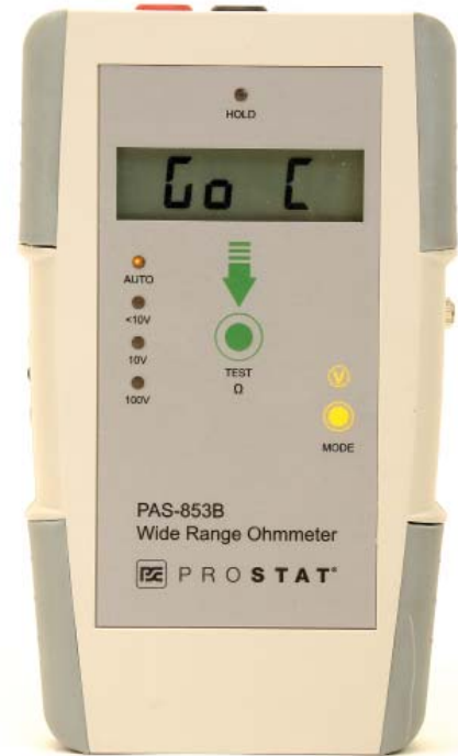
Figure 3: PAS-853B in Continuous Operation Mode