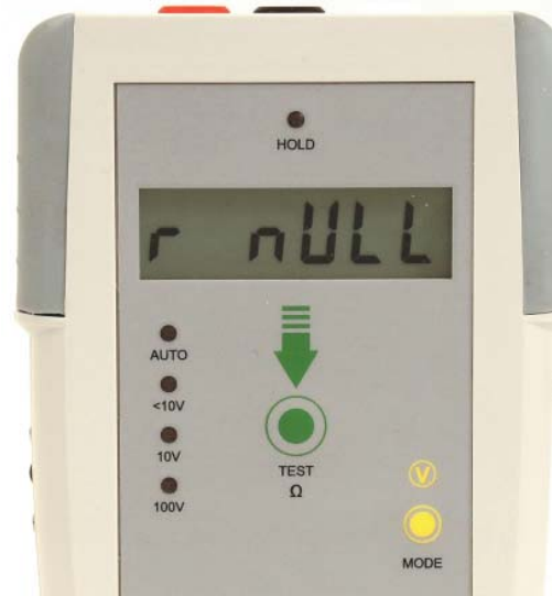
Figure 18: Press TEST and r nULL displays and starts