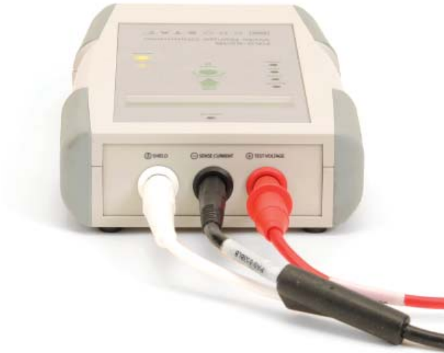
Figure 9: The shield is connected to the meter via the White banana plug and receptacle