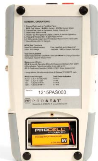
Figure 21: Battery Replacement