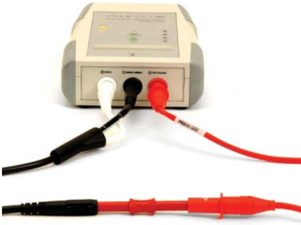
Figure 13: Short the test leads together with the supplied shunt.